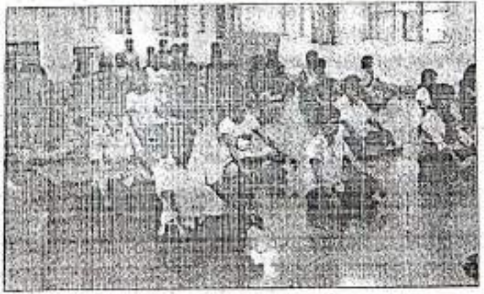
पीपुल्स युनिवर्सिटी में योग मुद्राएं सीखते विद्यार्थी

है और निरोगी काया के लिए अपनाया है। आज के इस दौर में प्राणायाम शरीर की मानसिक रूप से स्वस्थ्य और निरोगी रखने का सबसे सरल और उपयुक्त माध्यम है। इसका उद्देश्य कर्मचारी एवं छात्र-छात्राओं की मानसिक शक्ति की विकसित करना है, जो कि अध्ययन एवं आधुनिक तकनीक को सीखने में सहायक हो सके।वर्तमान परिवेश में सफलता की प्रतियोगी दौड़ में शामिल होने एवं लक्ष्य प्राप्ति के लिए अतिरिक्त मानसिक एवं शारीरिक शक्ति की आवश्यकता है। साधारण जान और सोमित शक्ति के द्वारा आजं सफलता प्राप्त करना लगभग असंभव है। इसलिए अपनी